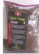
Medium Resealable Bag (approx 3lb)