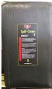
XL Bag (approx 70 lbs)