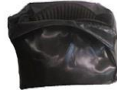
Below Grate Drain Filter

Our Natural Absorbent is hydrophobic - This means it absorbs products such as oils, paints and other hydrocarbon fluids while not absorbing water.